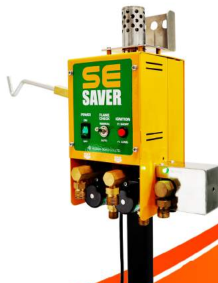
SE-II + N 2