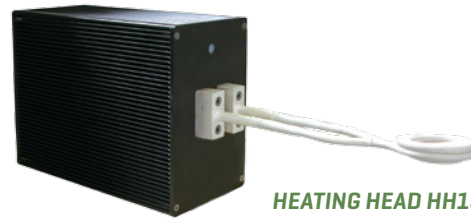
HEATING HEAD HH13 for Power Cube 90/50 and 180/50

The use of innovative technology and latest-generation components places the 50 series generators in a class of their own in terms of performance, power output and operational cost.