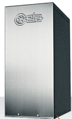
POWER CUBE 90/50 POWER CUBE 180/50