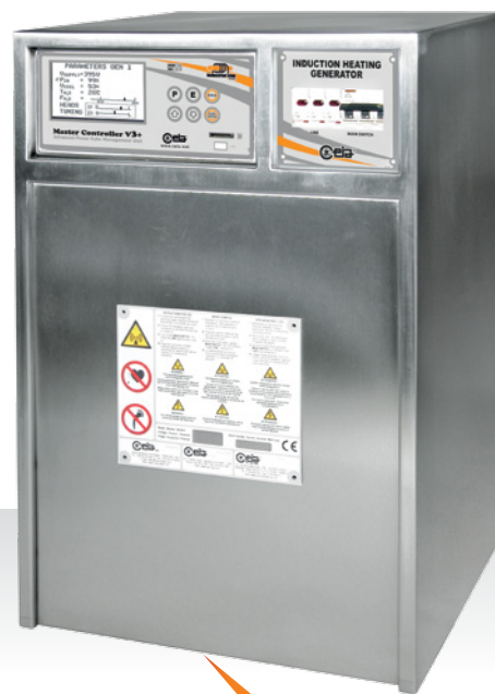
POWER CUBE 360/50