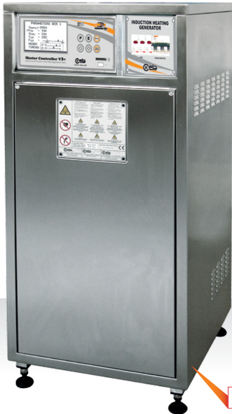
POWER CUBE 720/50